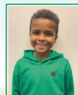
Year 3 Representative