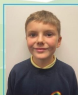
Year 4 Representative