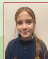
Year 6 Representative