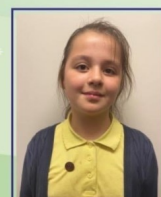
Year 5 Representative