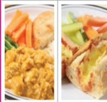
Chicken Korma served with Rice, Naan Bread & Seasonal Vegetable or Hot Pizza Baguette served with Carrot & Cucumber Sticks