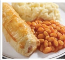
Homemade Sausage Roll served with Mashed Potato & Baked Beans