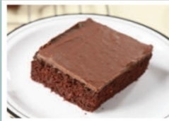
Wacky Chocolate Cake