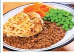
Collage Pie served with Seasonal Vegetables