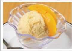
Ice Cream & Fruit