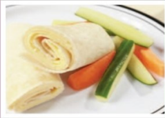
Deli Choice of Breads with a Selection of Fillings served with a Side Salad