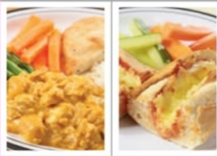
Chicken Korma served with Rice, Naan Bread & Seasonal Vegetable or Hot Pizza Baguette served with Carrot & Cucumber Sticks