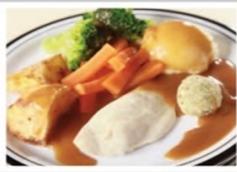
Roast Chicken served with Roast/Mashed Potatoes, Seasonal Vegetables & Gravy