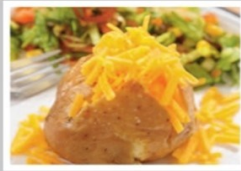
Jacket Potato with a Selection of Fillings served with a Side Salad

VEGETARIAN VERSION OF THE ABOVE AVAILABLE DAILY