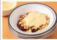
Fruit Crumble & Custard