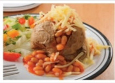
Jacket Potato with a Selection of Fillings served with a Side Salad