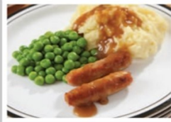
Sausages served with Mashed Potato, Seasonal Vegetables & Gravy