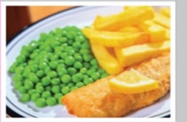
Battered Fish (MSC) served with Chips & Peas or Baked Beans

VEGETARIAN VERSION OF THE ABOVE AVAILABLE DAILY