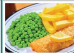
Battered Fish (MSC) served with Chips & Peas or Baked Beans

VEGETARIAN VERSION OF THE ABOVE AVAILABLE DAILY