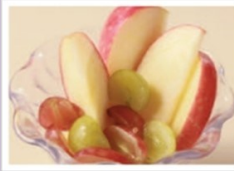
Apple & Grape Pot