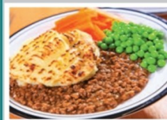
Cottage Pie served with Seasonal Vegetables