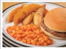
Beef Burger served in a Bun with Potato Wedges & Seasonal Vegetables or Baked Beans