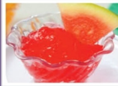
Jelly & Fruit