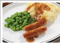
Sausages served with Mashed Potato, Seasonal Vegetables & Gravy