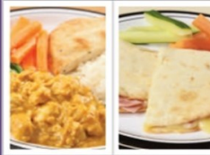
Chicken Korma served with Rice, Naan Bread & Seasonal Vegetable or Hot Cheese & Ham Wrap served with Carrot & Cucumber Sticks