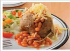
Jacket Potato with a Selection of Fillings served with a Side Salad