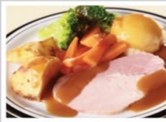
Honey Roast Gammon served with Roast/Mashed Potatoes, Seasonal Vegetables & Gravy