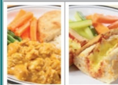
Chicken Korma served with Rice, Naan Bread & Seasonal Vegetable or Hot Pizza Baguette served with Carrot & Cucumber Sticks