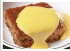
Sticky Toffee Pudding served with Custard