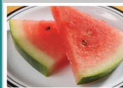
Fresh Water Melon Wedge