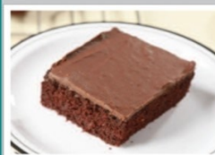
Wacky Chocolate Cake