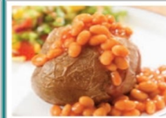
Jacket Potato with a Selection of Fillings served with a Side Salad