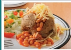
Jacket Potato with a Selection of Fillings served with a Side Salad