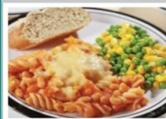
Cheesy Bean Pasta served with Garlic & Herb Bread and Seasonal Vegetables