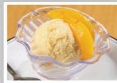
Ice Cream & Fruit