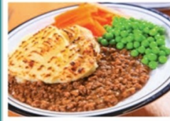
Cottage Pie served with Seasonal Vegetables