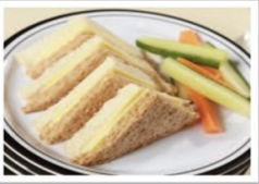
Deli Choice of Breads with a Selection of Fillings served with a Side Salad