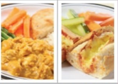
Chicken Korma served with Rice, Naan Bread & Seasonal Vegetable or Hot Pizza Baguette served with Carrot & Cucumber Sticks