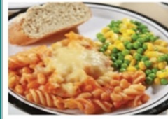
Cheesy Bean Pasta served with Garlic & Herb Bread and Seasonal Vegetables