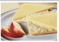
Cheese & Crackers