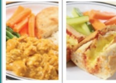
Chicken Korma served with Rice, Naan Bread & Seasonal Vegetable or Hot Pizza Baguette served with Carrot & Cucumber Sticks