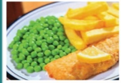
Battered Fish (MSC) served with Chips & Peas or Baked Beans

VEGETARIAN VERSION OF THE ABOVE AVAILABLE DAILY