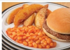
Beef Burger served in a Bun with Potato Wedges & Seasonal Vegetables or Baked Beans