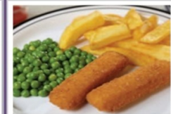
Fish Fingers served with Chips & Peas or Baked Beans

VEGETARIAN VERSION OF THE ABOVE AVAILABLE DAILY