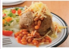
Jacket Potato with a Selection of Fillings served with a Side Salad