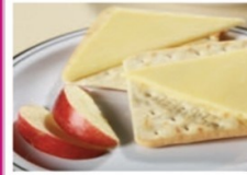
Cheese & Crackers