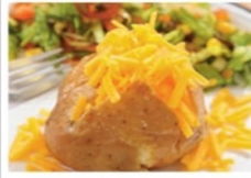
Jacket Potato with a Selection of Fillings served with a Side Salad

VEGETARIAN VERSION OF THE ABOVE AVAILABLE DAILY