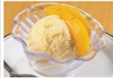
Ice Cream & Fruit