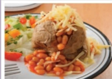
Jacket Potato with a Selection of Fillings served with a Side Salad