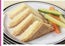
Deli Choice of Breads with a Selection of Fillings served with a Side Salad