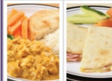
Chicken Korma served with Rice, Naan Bread & Seasonal Vegetable or Hot Cheese & Ham Wrap served with Carrot & Cucumber Sticks