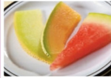
Trio of Melon